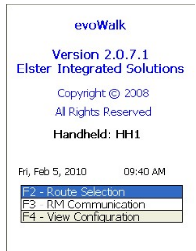
evoWalk main screen